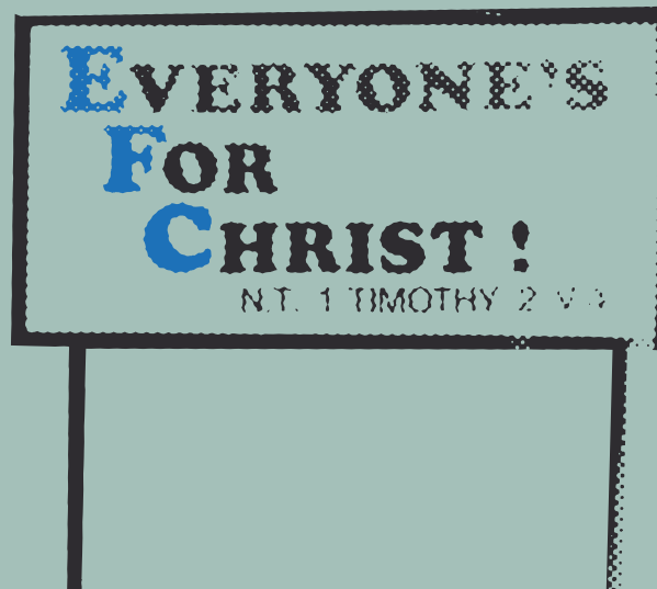
Highlighted Scripture: 1 Timothy 2 v 4 'God our Saviour desires all people to be saved and to come to the knowledge of the truth.'