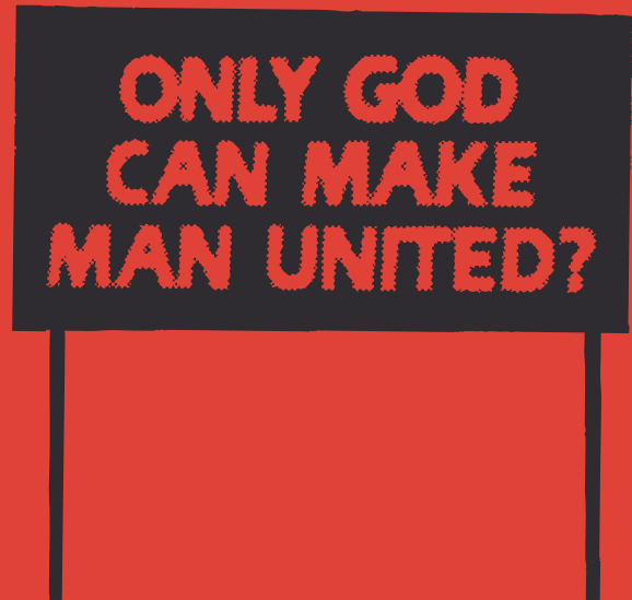
During the run up to the 1985 F.A. cup final