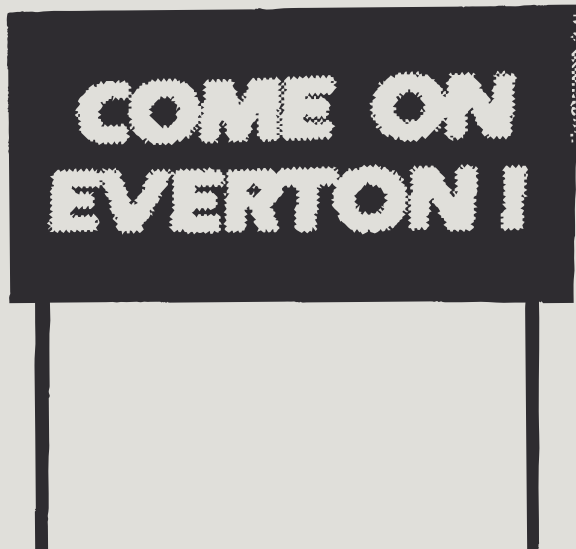
Signs outside St Mary's Edgehill: